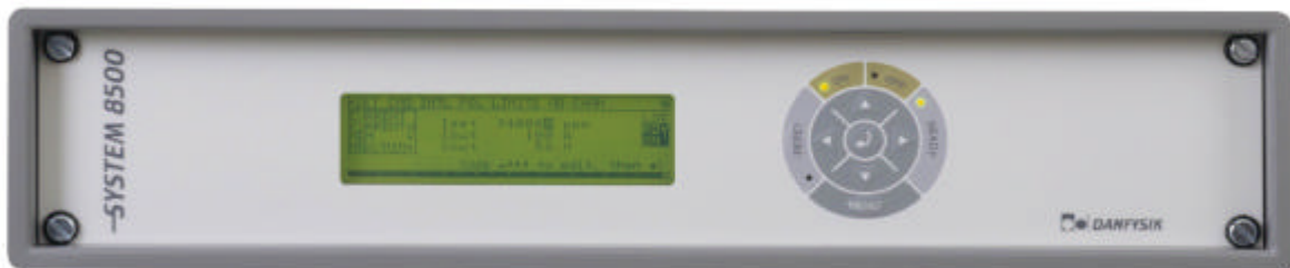
SYSTEM 8500 Control Panel (M-Panel)

The SYSTEM 8500 is a result of intensive development and a careful planned evolution of our well known SYSTEM 8000 which is powering thousands of magnets in particle accelerator laboratories world wide, with ultra stable currents and very high reliability records.