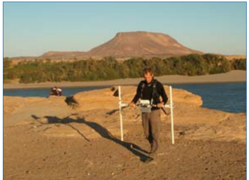
Prize winner: The Bartington Grad601 Gradiometer System pictured hard at work in Sai Island, Sudan