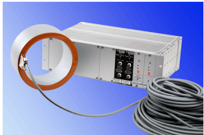
NPCT with 175-mm sensor head