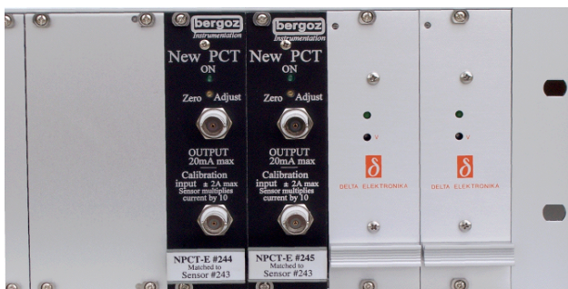
New-PCT Chassis with NPCT-E electronics and power supplies